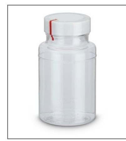
Water Bottles * (QTY)