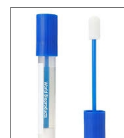
HiCap Swabs (QTY)