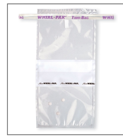
Water Bags * (QTY)