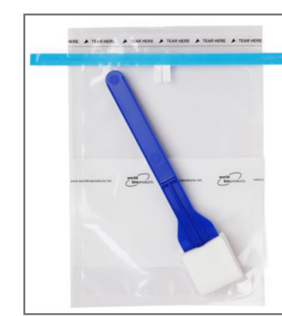
HiCap Sponges (QTY)