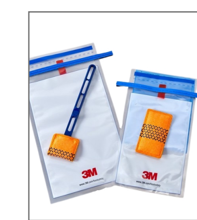
Enviro. Scrub Sampler (ESS) (QTY)